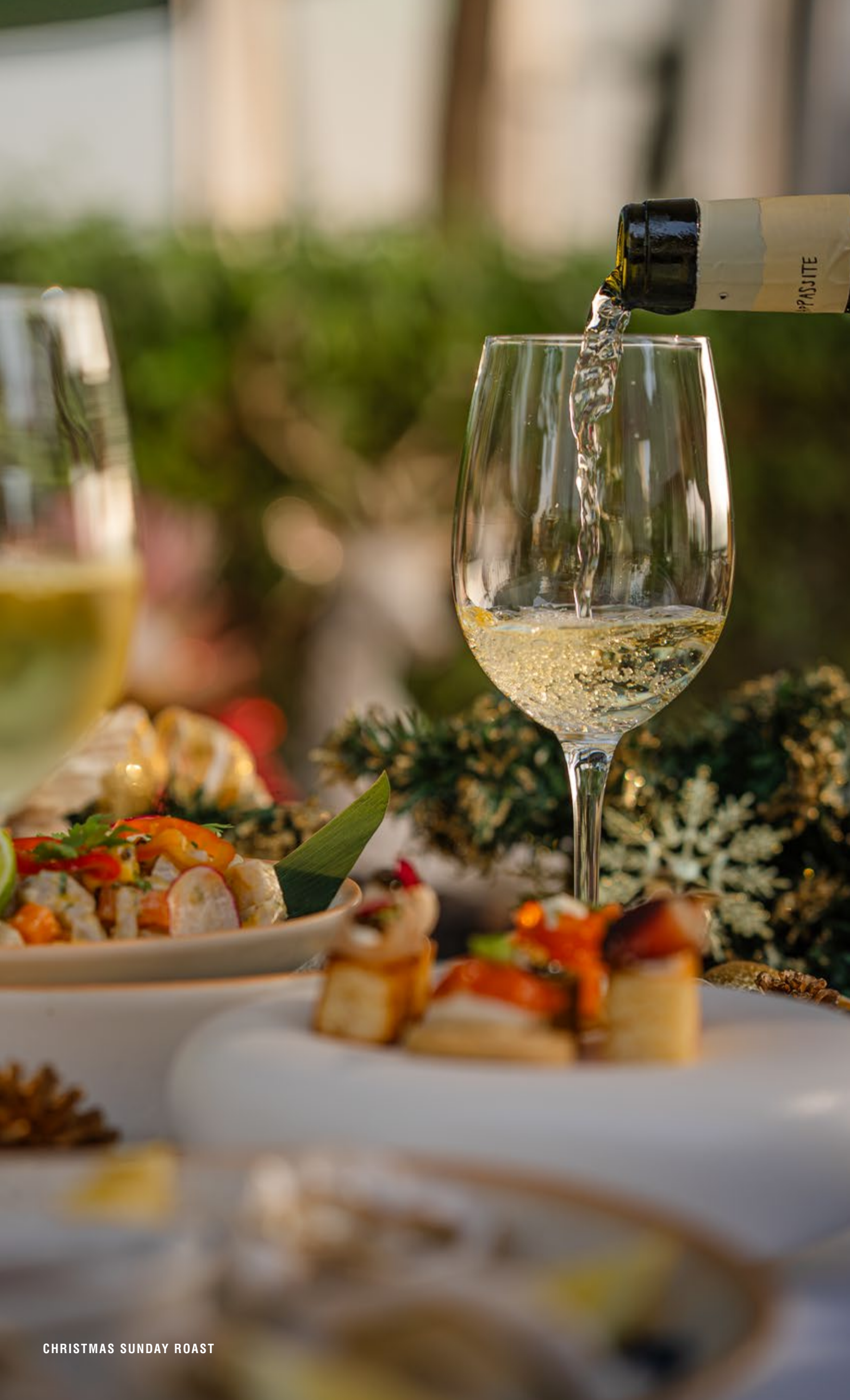
CHRISTMAS SUNDAY ROAST