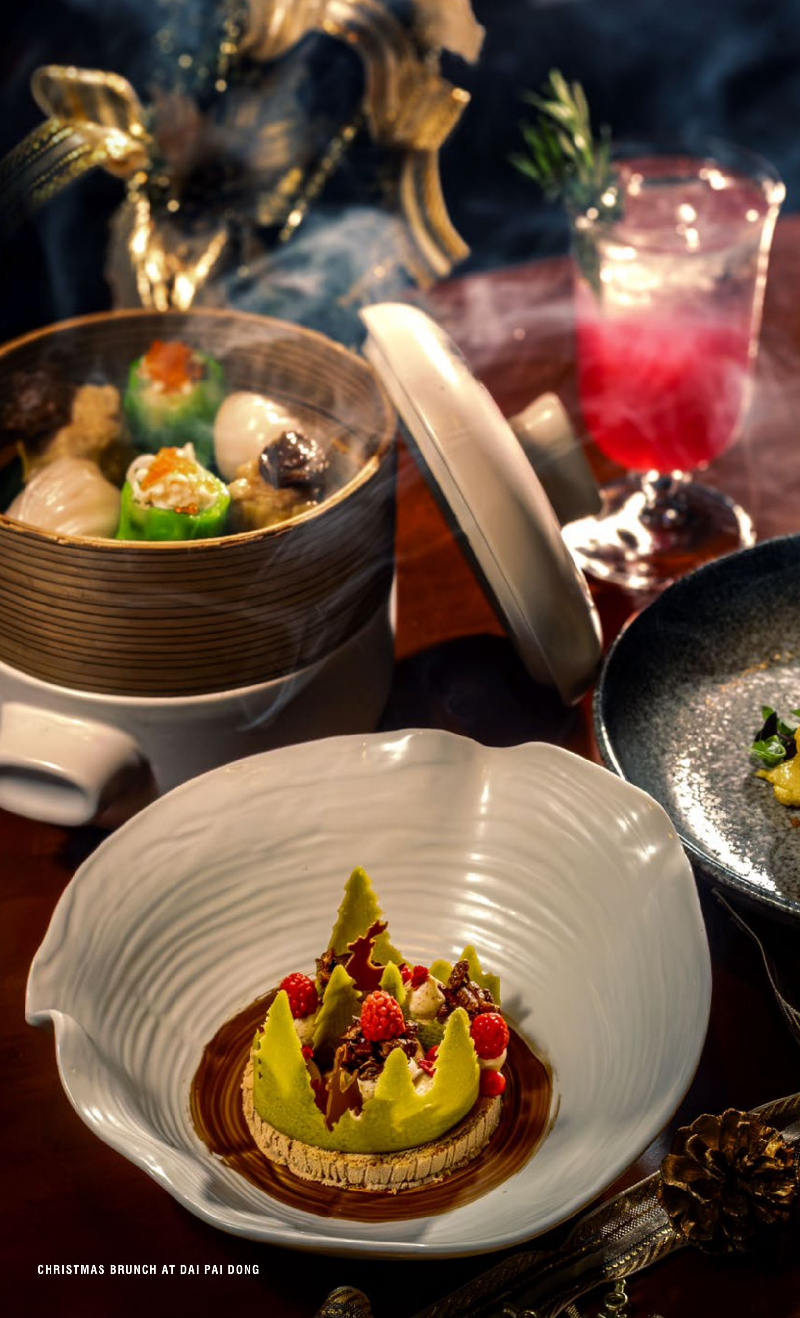
CHRISTMAS BRUNCH AT DAI PAI DONG