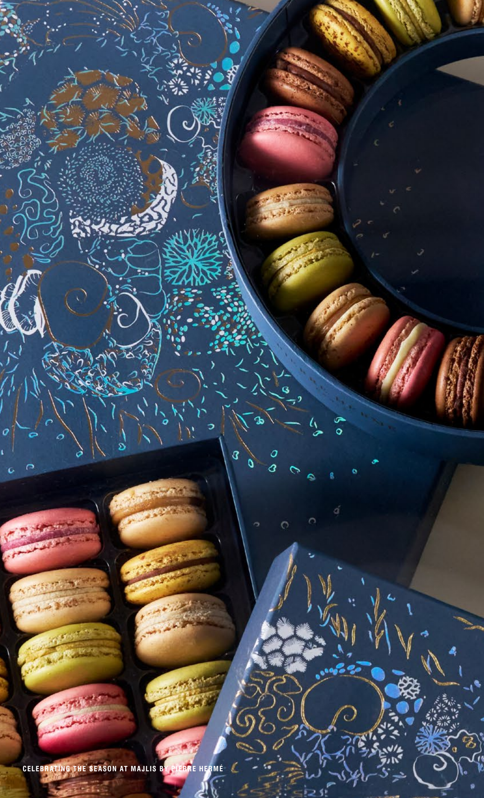
CELEBRATING THE SEASON AT MAJLIS BY PIERRE HERMÉ