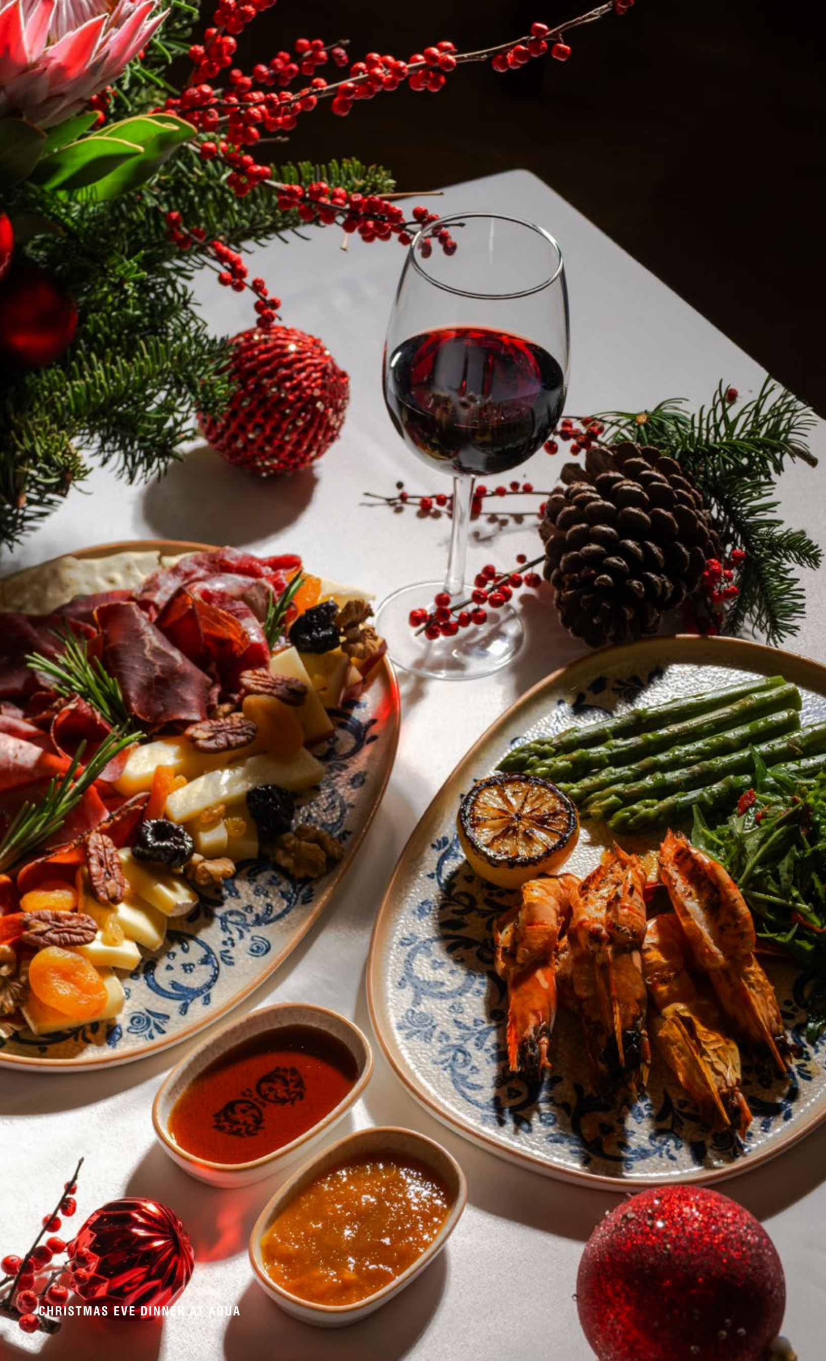
CHRISTMAS EVE DINNER AT AQUA